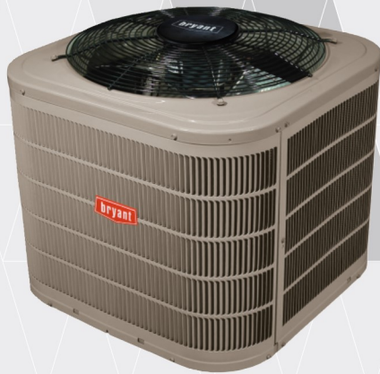
Models 227T, 225S