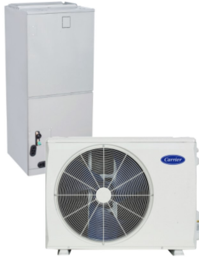
MODEL 38MURA HEAT PUMP with 40MUAA AIR HANDLER

Carrier was the first to offer systems with Puron® refrigerant, which does not contribute to ozone depletion. By replacing an older, less efficient horizontal heat pump with a Performance Series system, you could reduce your energy use and environmental impact.