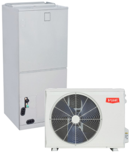
MODEL 38MURA HEAT PUMP with 40MUAA AIR HANDLER