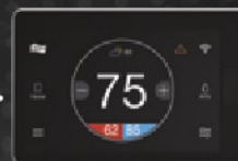
EcoNet Smart Thermostat