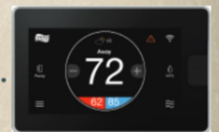
EcoNet Smart Thermostat