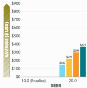
ANNUAL ENERGY COST SAVINGS FOR COOLING 10.0-SEER BASELINE*